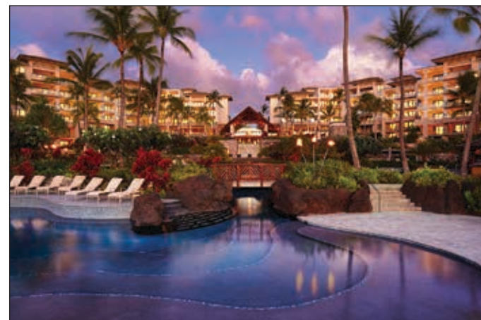
Montage Deer Valley in Utah (left); Montage Kapalua Bay in Hawaii (above)