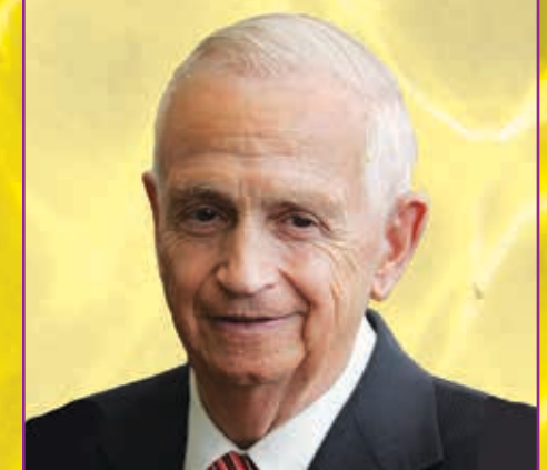
J.W. MARRIOTT, JR.