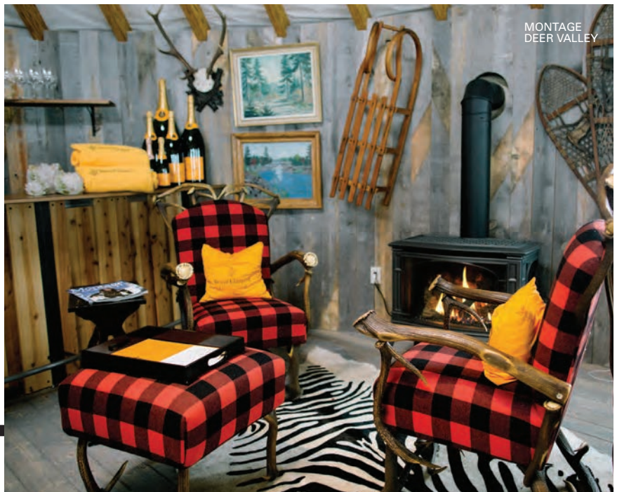
MONTAGE DEER VALLEY