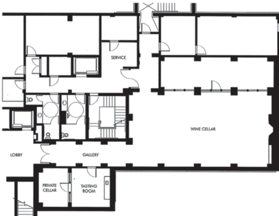
RIVER HOUSE — WINE CELLAR