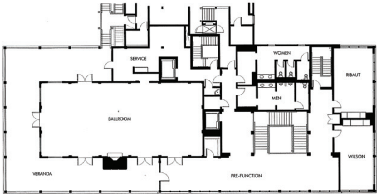
RIVER HOUSE — SECOND LEVEL