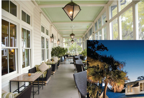
Porch view of the Montage

These chic, high-spec southern-style villas offer forest & waterfront views in a luxury Lowcountry resort. Accommodations include spacious cottages, guest rooms, suites and village homes that pay homage to the region's rich heritage. Phone: 843.706.6500 Address: 477 Mt. Pelia Road, Bluffton, SC montagehotels.com/palmettobluff