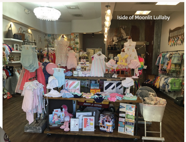
Inside of Moonlit Lullaby

48. PEACEFUL HENRY'S Do I smell a campfire? Nope. That's just Peaceful Henry's, Bluffton's own cigar bar with their wide selection of cigars and accessories to choose from. Phone: 843.757.0557 Address: 181 Bluffton Rd, Bluffton, SC peacefulhenrys.com