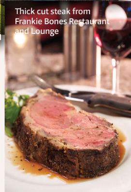
Thick cut steak from Frankie Bones Restaurant and Lounge

The Rhett House is a classic Southern inn located in the heart of Beaufort's Historic Landmark District set in three buildings, including an antebellum mansion, with antique decor & happy-hour champagne. Phone: 843.524.9030 Address: 1009 Craven St, Beaufort, SC rhetthouseinn.com