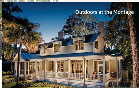
Outdoors at the Montage

This elegant inn welcomes all with classic Southern hospitality, style and comfort with polished rooms & cottages, plus a day spa & free breakfast in an upscale bistro. Phone: 843.379.4667 Address: 809 Port Republic St, Beaufort, SC beaufortinn.com