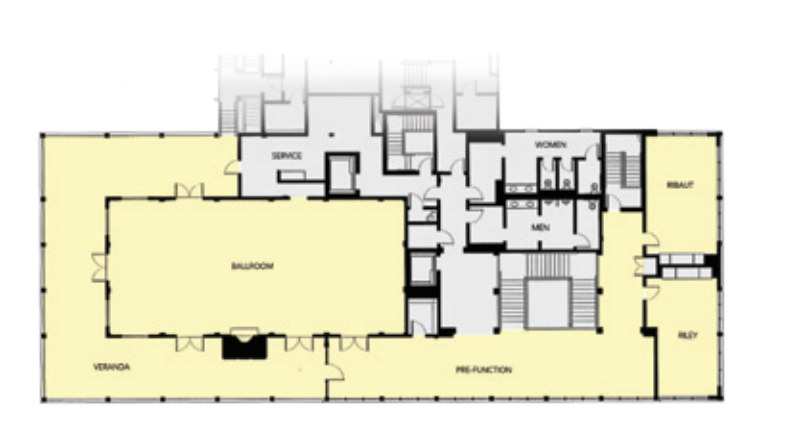
RIVER HOUSE — SECOND LEVEL