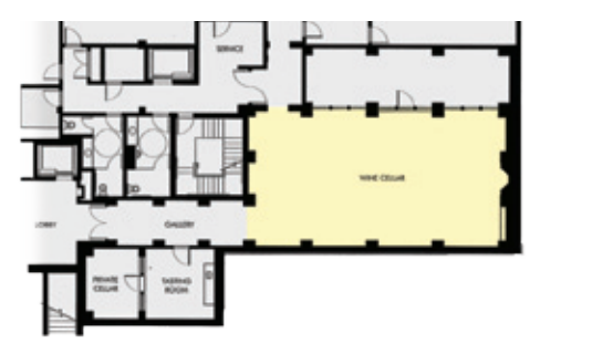
RIVER HOUSE — WINE CELLAR