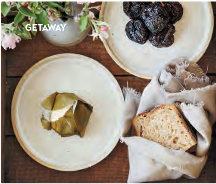
Above: Cheese with pruned apples at the Restaurant at Meadowood. Right: A guest-room patio at Las Alcobas.