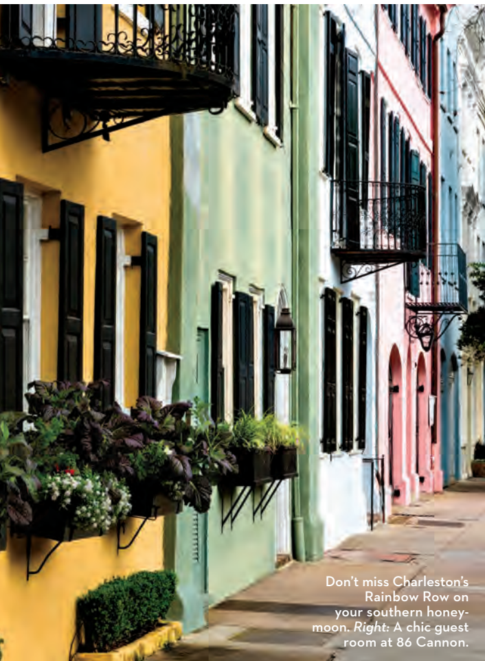
Don't miss Charleston's Rainbow Row on your southern honeymoon. Right: A chic guest room at 86 Cannon.