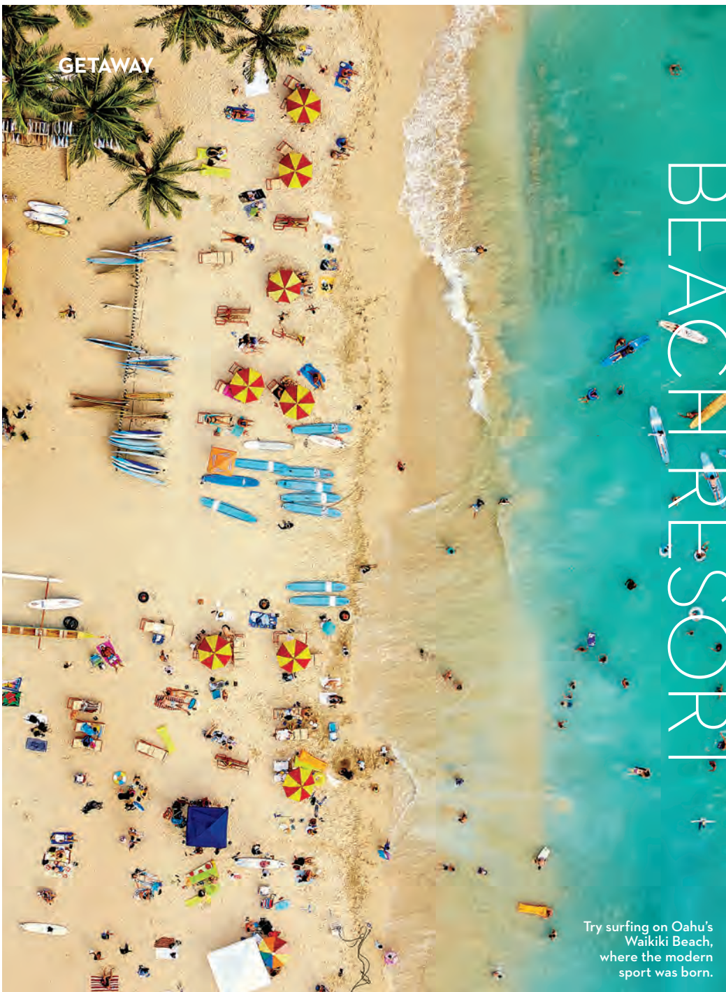
Try surfing on Oahu's Waikiki Beach, where the modern sport was born.