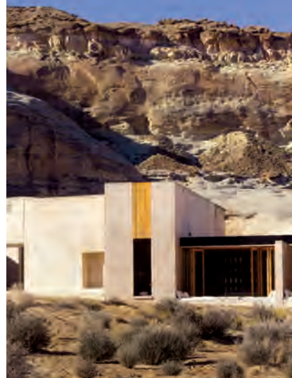
Architecture and environment become one at Amangiri in Canyon Point, Utah.