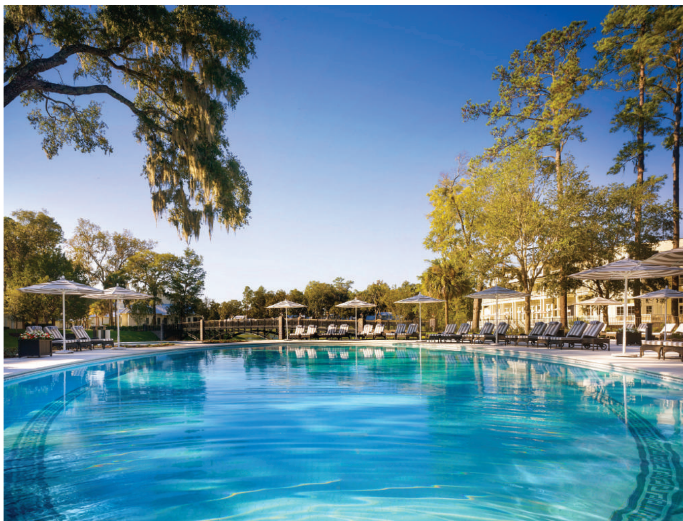
Pool at Montage Palmetto Bluff

have luxurious residential touches, such as vaulted ceilings, fireplaces, opulent bathrooms, and verandas with stunning views of waterways, flora, and fauna (watching the dozens of species of birds come and go at dusk and dawn is spectacular).